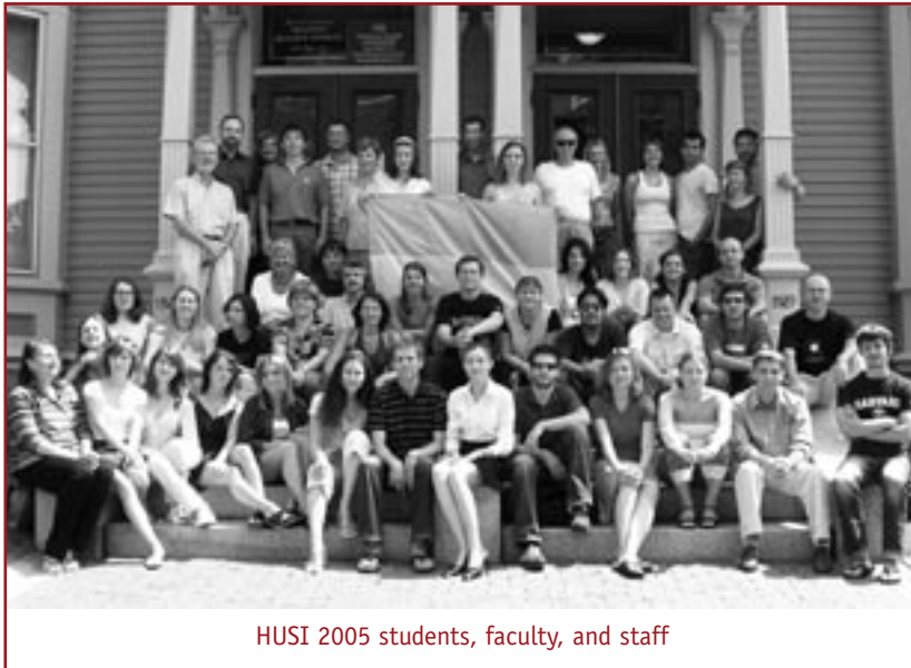
HUSI 2005 students, faculty, and staff

Finally, at the gala performance evening held on August 12, language students from all levels performed in Ukrainian—many for the first time—in the traditional series of farcical sketches.