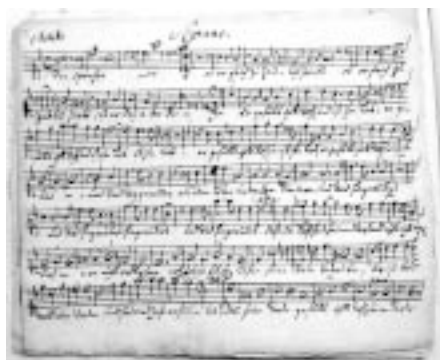
Manuscript page from the Sing-Akademie Archive in Kyiv.

The over 5,000 music scores from the Sing-Akademie Library in Berlin identified this summer in Kyiv undoubtedly represent the most valuable trophy collection to have surfaced in Ukraine. Negotiations between Ukrainian archival authorities and Harvard representatives (including HURI) are currently underway to develop a collaborative project between the University, the Packard Humanities Institute, and the Ukrainian Archival Administration to make these uniquely important materials available for research and performance. It is hoped that the Academy of Music in Kyiv will also be able to participate. The project will also be closely coordinated with the Sing-Akademie of Berlin, one of Germany's oldest continuing performing organizations, and there is hope that the priceless musical sources will eventually be returned to their original home.