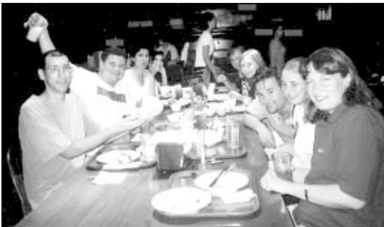
Students enjoy themselves at the Ukrainian Table, which was held at Loker Commons.